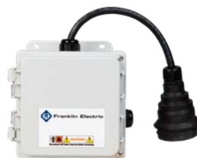
Junction Box Black Plug