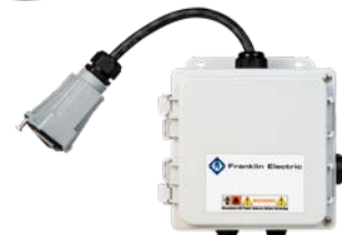
Junction Box Gray Plug