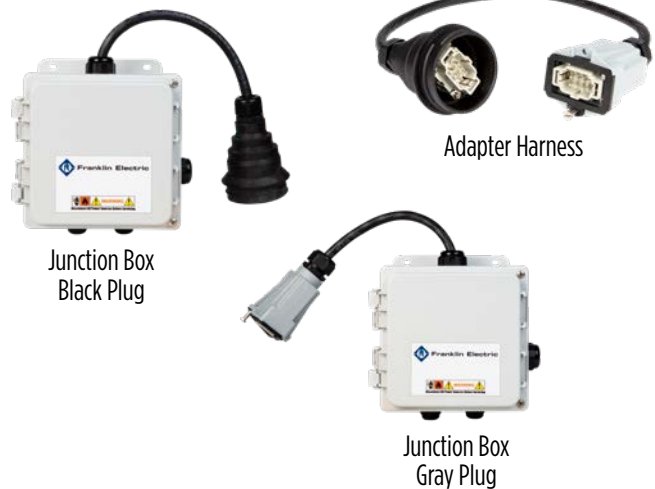
Junction Box Black Plug